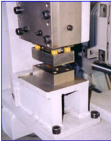
Hydraulic shear station