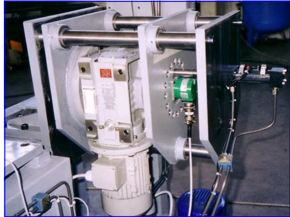
Vertical bending station